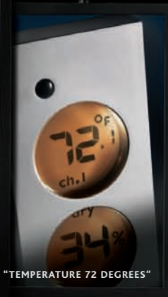
"TEMPERATURE 72 DEGREES"