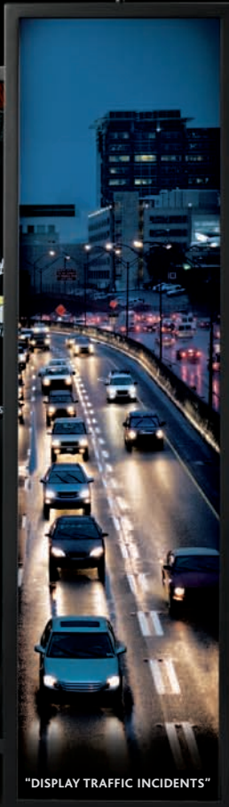
"DISPLAY TRAFFIC INCIDENTS"