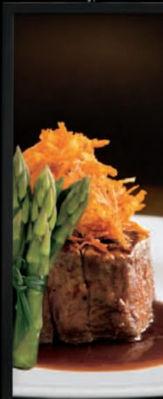
"FIND NEAREST ZAGAT RESTAURANT"